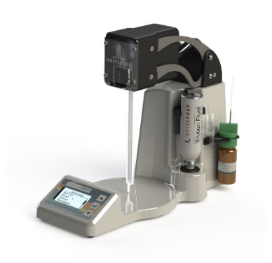
The Concentrating Pipette Select™

InnovaPrep (Drexel, MO) provided a CP-150 Concentrating Pipette base station to LLNL for this testing. The Concentrating Pipette is an automated, rapid micro-particle concentrator that uses dead-end filtration to capture particles onto the surface of a porous membrane filter within the Concentrating Pipette's single-use tip. After the sample has been processed and particles have been trapped on the filter, InnovaPrep's patented Wet Foam Elution™ process is initiated by the press of a button to rapidly elute the particles from the membrane surface into a volume few drops of clean buffer solution. The system accommodates a variety of Pipette Tips based on pore size. For this testing two Tip types were used: The 0.05 µm and the Ultafilter ~ 150 KD pore size cut-off.