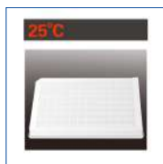
2. Add samples/controls