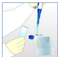
1. Sample preparation