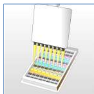
5. Stop reaction